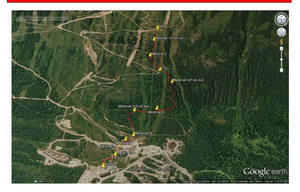
Length: 2,210m Descent: 441m